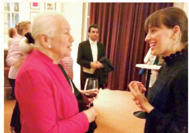
Left: Exhibition of paintings and concert of young artists and musicians