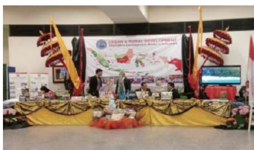
One of the 44 exhibits: Alternative Development Programme by the Government of Indonesia

The SDGs were present in all statements, discussions and papers. The INCB Director recalled the recommendations on gender issues in the INCB report 2016. I also want to reiterate here the ICW resolution on “Women and Drug Abuse” adopted in 2003 and the CND 2017 Side event by ICW and WIZO “Addiction and Gender”. Listen first” is an UNODC Initiative stating: listening to children and youth is the first step to help them grow healthy and safe. It concentrates on the SDGs 3, 5 and 16. www.unodc.org/listenfirst . Strong Families Programme