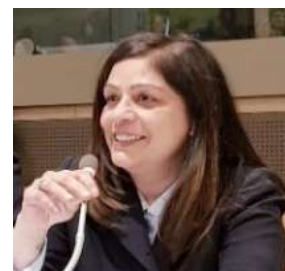
Dr. Anuradha Seth

Dr. Seth stressed the importance of social protection in poverty reduction, gender equality and equitable growth and she elaborated on the changing dynamics of labor and capital due to changing production processes. Noting that the informal economy employs 740 -million women who have limited access to social protection which affects their income and security, Dr. Seth reiterated that social protection should be designed systematically in consideration of complex gender dynamics that hinder women from entry into the formal economy, decent job opportunities, and access to public services. As an UN Women's Advisor for macroeconomic policies, Dr. Seth noted that macroeconomic policies must prioritize gender equality as a core objective. She concluded that broad political consensus must be built in support of gender inclusive growth and the economic value of women.