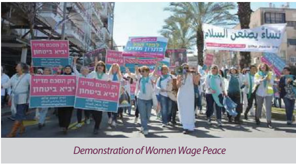
Demonstration of Women Wage Peace

On its part, the grassroots movement Women Wage Peace (WWP) held, last November, a very successful International Congress with the participation of some 1000 women and students from all universities in Israel. The target audience of the congress was the young generation – our future leaders. Israeli and International experts, Knesset members and public figures took part in its very interesting panels and workshops