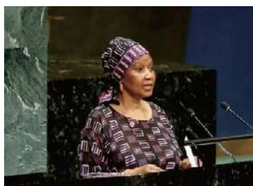
Ms. Phumzile Mlambo-Ngcuka

In his opening speech for CSW63, UN Secretary General Antonio Guterres spoke on the importance of increasing women's participation in decision-making process in order to face our global crises ahead.